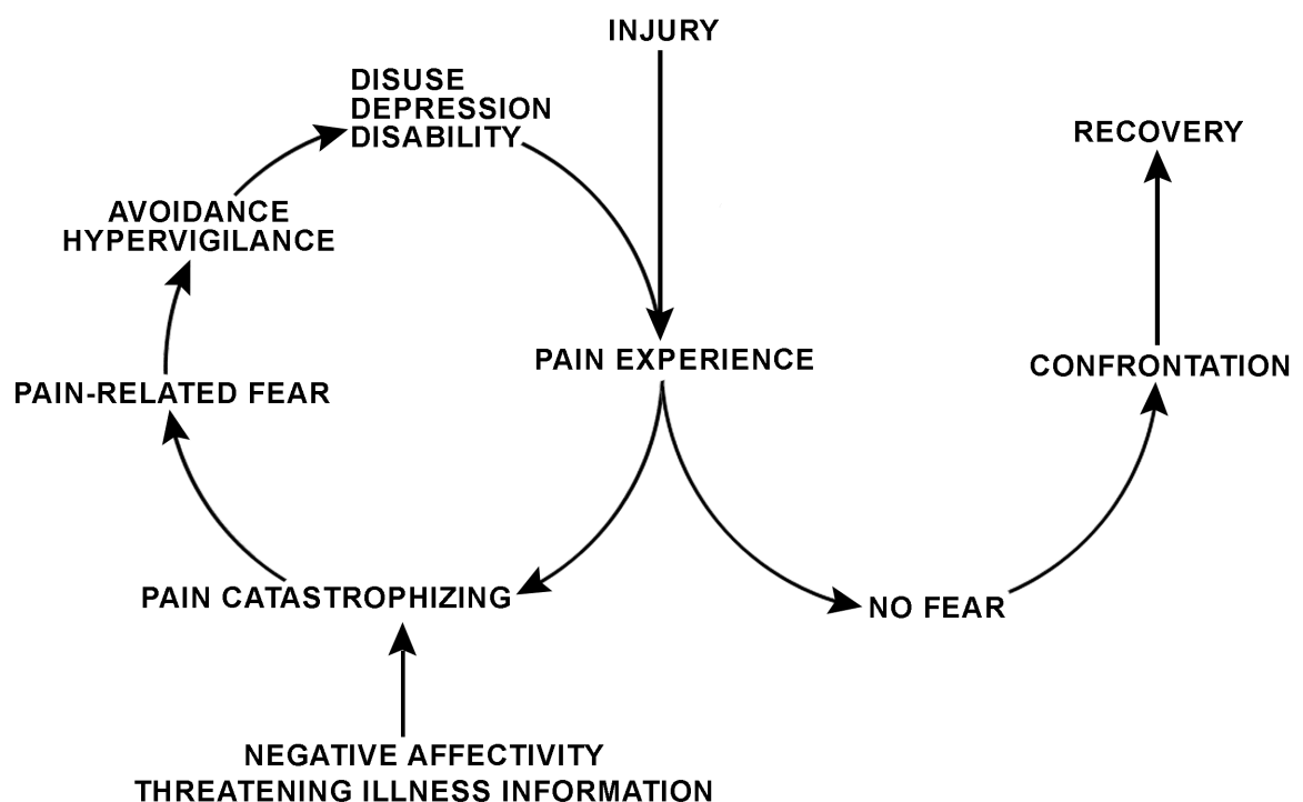
Figure 1. The fear-avoidance model of chronic pain. Adapted from “Fear avoidance and its consequences in musculoskeletal pain: A state of the art,” by J. W. Vlaeyen and S. J. Linton, 2000, Pain , 85, p. 329. Used with permission from IASP.

Psychological models of chronic pain, such as the well-supported fear-avoidance model, show that the way people interpret and respond to their pain sensations is a strong determinant of their future pain experience [52, 20]. Cognitions shape not only psychological outcomes such as emotional functioning, but the nervous system activity underlying pain perception [50, 39]. It is therefore unsurprising that maladaptive pain cognitions, such as pain catastrophizing, are associated with emotional and behavioural responses (e.g., fear and avoidance) that predict depression, functional disability and future pain [26].